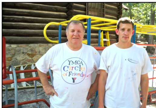
Sprucing up the playground at the YMCA's Camp Hamilton